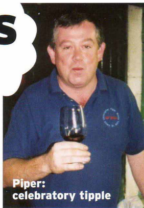
Piper: celebratory tippie